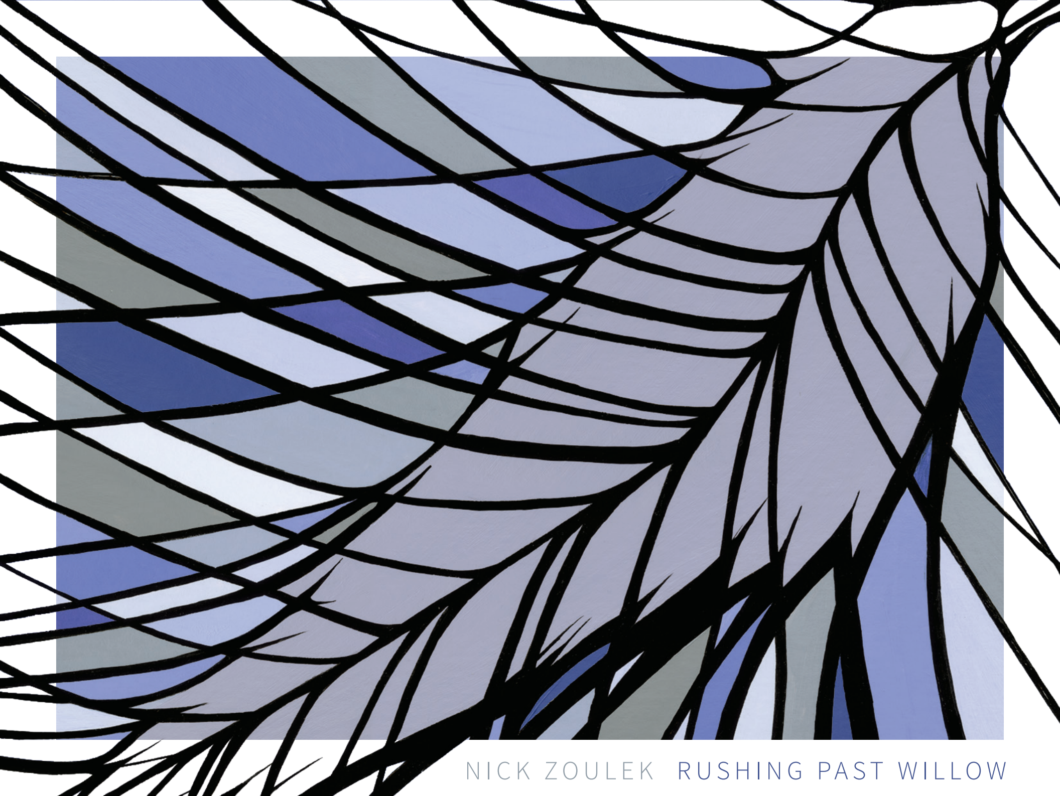
NICK ZOULEK RUSHING PAST WILLOW